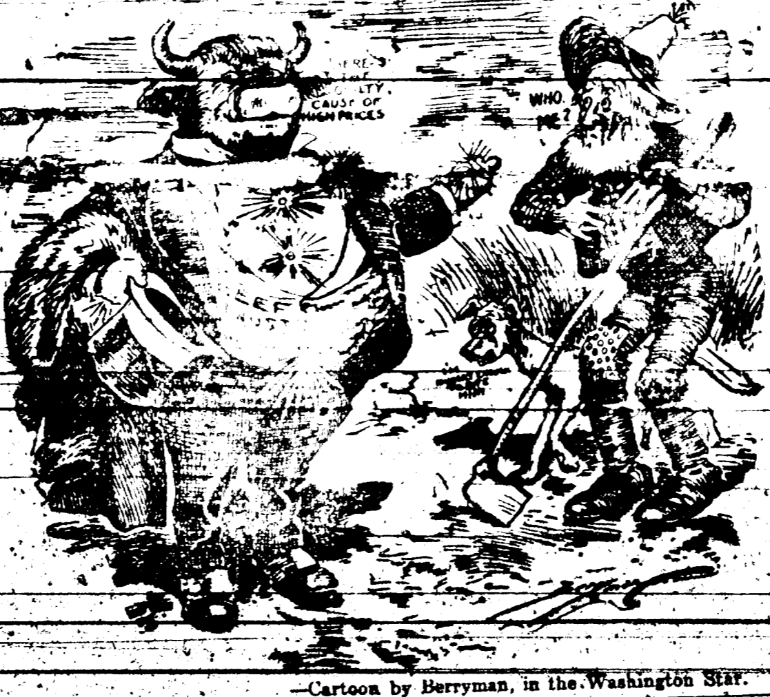
Cartoon by Berryman, in the Washington Star.